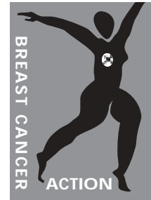
BCA Lapel Pin $15.00

Designed by late BCA board member Lucy Sherak White pin/black & red type; 2 1/4"