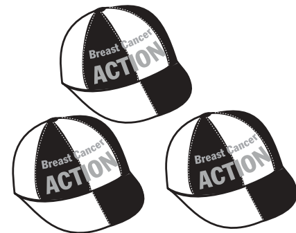
BCA Hat $10.00