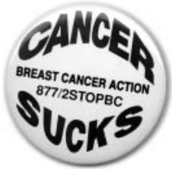
BCA Button $3.00

Designed by late BCA board member Lucy Sherak White pin/black & red type; 2 1/4"